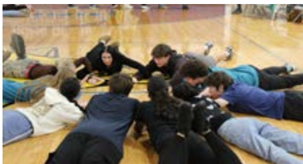
Above: Attendees at the Fall TALK event participate in an activity that supports team bonding.

TALK is a student-led event that focuses on the mental health of our student body. The fall event, which was held on