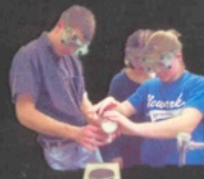
Problem Solving & Collaborative Skills