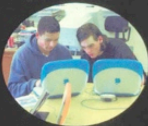
Application of Technology