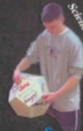
Science & Mathematics