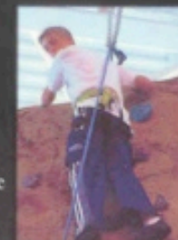
Physical & Kinesthetic